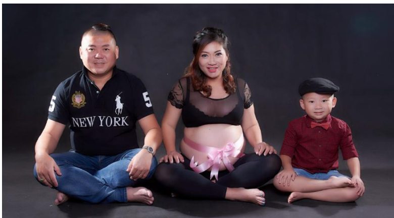
A memorable photo taken in 2018 when I was at 38 weeks pregnant. My daughter was born in May the same year.