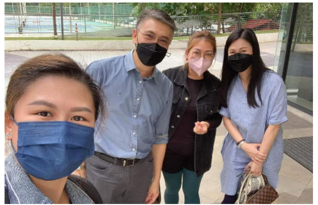
Photo with founders

Having relied heavily on her husband, she now had to be self-sufficient. “Now that he’s gone, I have to be independent. Life is transient – we have to cherish our loved ones always. The biggest risk that married women face is losing their husbands. We must know the importance of ‘readying the house before the storm’ so that when anything happens, we are ready and have the strength to soldier on. In my case, I’m glad I have my BE family, business, uplines and downlines.”