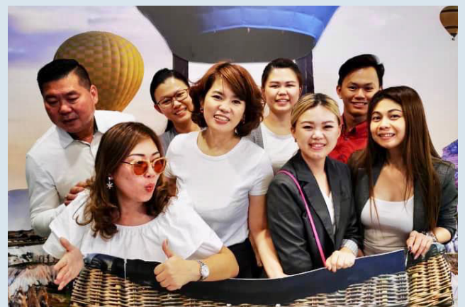
Fighting together to qualify for BE Lifestyle to Turkey