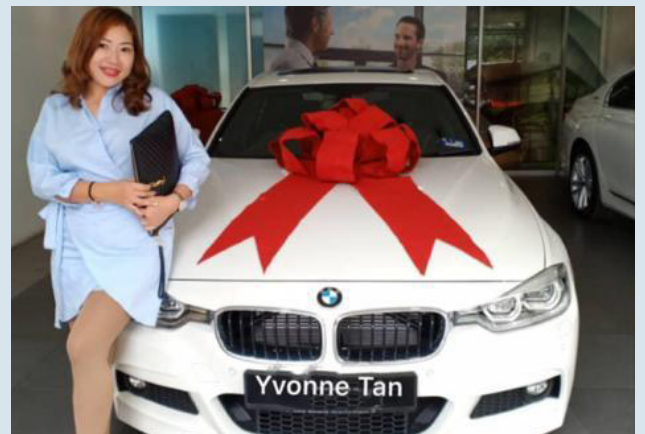
My very first BMW

As a housewife of many years, she knew that women needed to have their own source of income. After realizing the miraculous power of