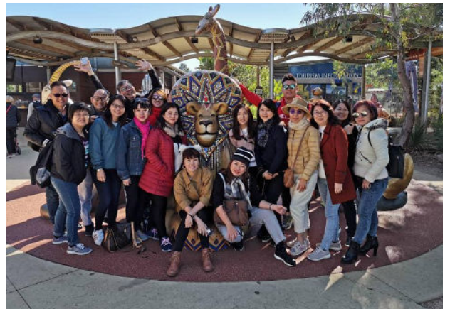
BE Lifestyle Campaign to Melbourne