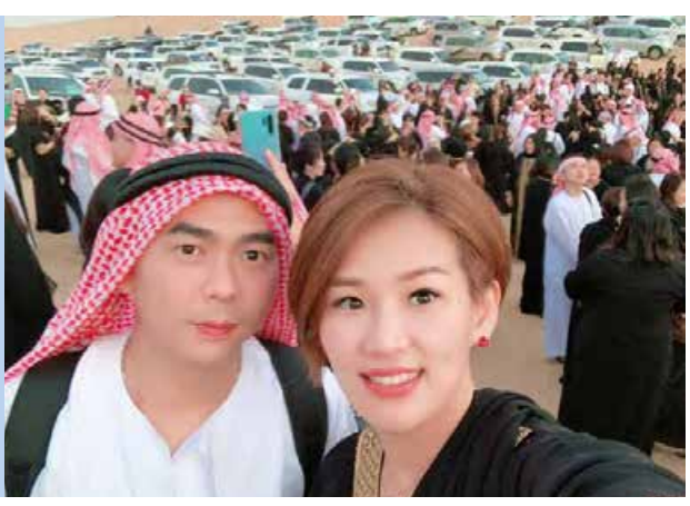
BE Lifestyle Travel to Dubai

"Our BE business was beginning to thrive. Sadly, my father is not here to enjoy the fruits of our success. While you still have time, grab this opportunity. Go all out so that you can celebrate your success with your family while they are still around. Leave no regrets."