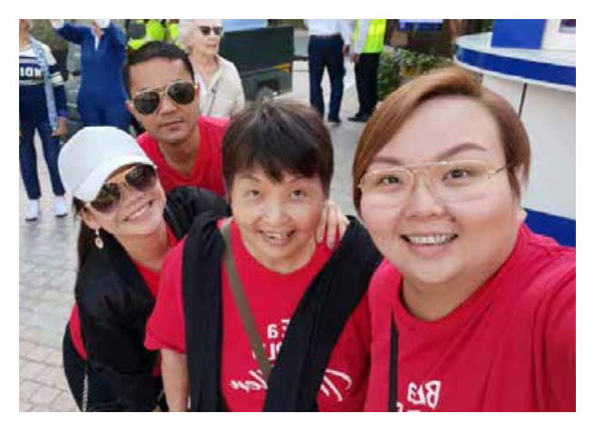
BE Lifestyle Travel to Korea