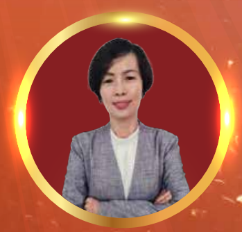
CCA LER SEE TIN / CHIA AH FUU