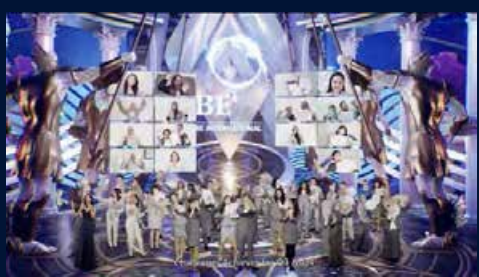
More than 630 achievers