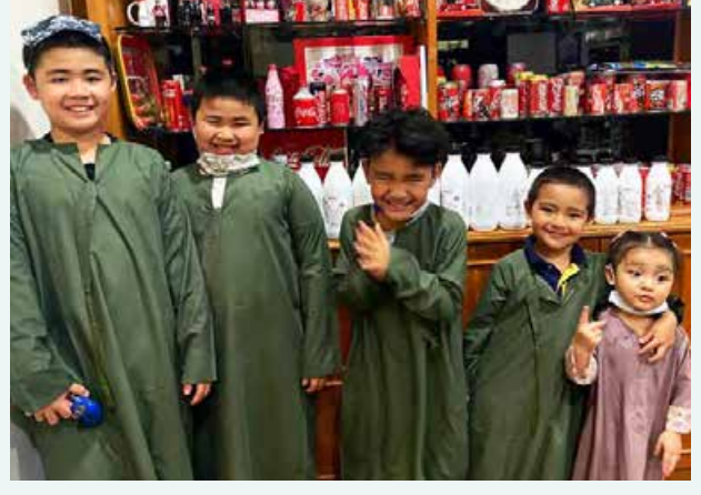
My beloved children