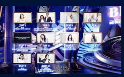
Top Sponsor Achievers Q3 & Q4