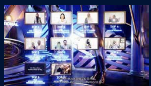
CCA Assemble Achievers Q3 & Q4