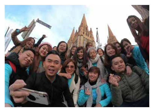
BE Lifestyle Travel to Melbourne